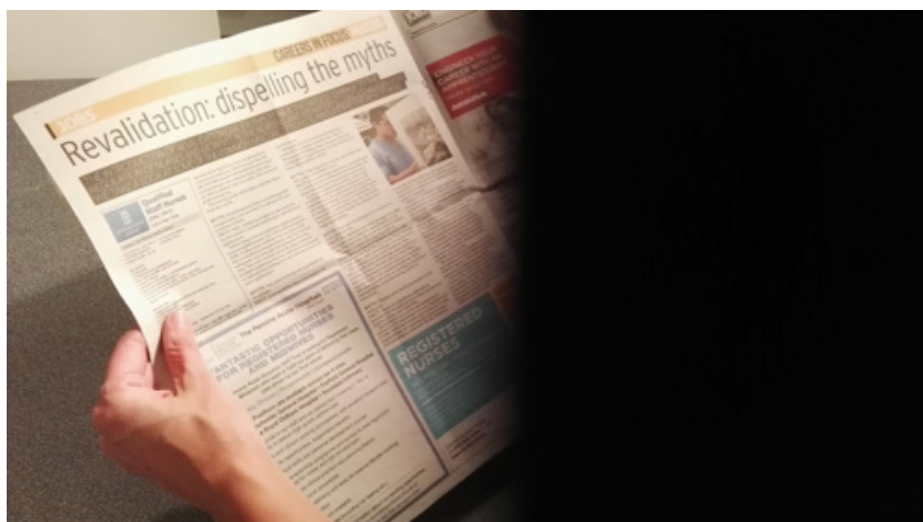
Field of vision in right homonymous hemianopia

For example: a complete loss of visual field to the right (hemianopia) means that a person will be unable to see objects on their right hand side or communicate effectively with people positioned to their defective side. If they move their head and eyes to the right they can bring the object or person into their field of view. This is not due to damage of the eyes but the visual pathway in the brain.